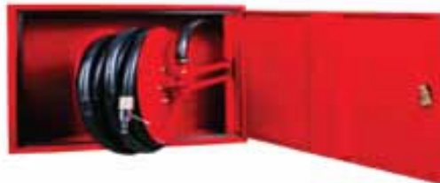
Hose reel with cabinet (swinging type)