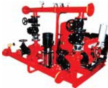
Hydrant Fire pump