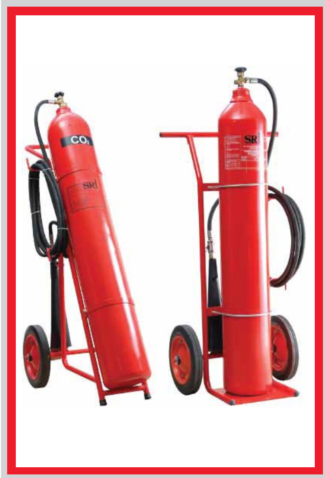
Carbon dioxide trolley